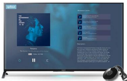
Qobuz with Chromecast