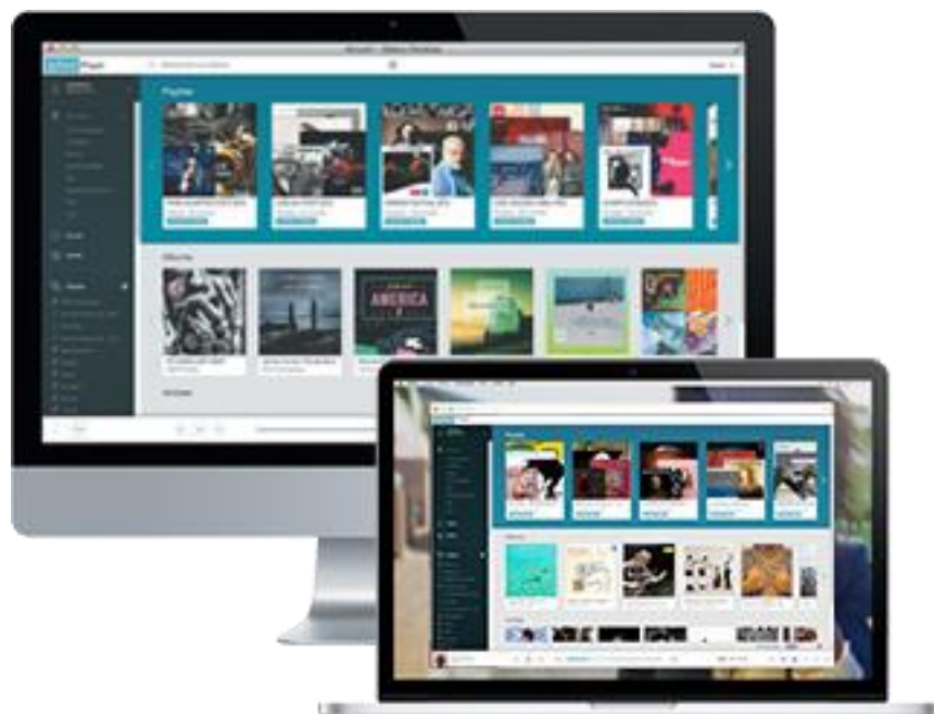
The Qobuz Player

Furthermore, Qobuz has devoted this first quarter to large-scale projects, such as rewriting the search engine algorithm and redesigning the Desktop app to incorporate Hi-Res-compatibility.