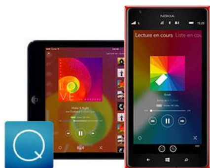
Qobuz for smartphone iOs, Android, Windows Phone, Amazone