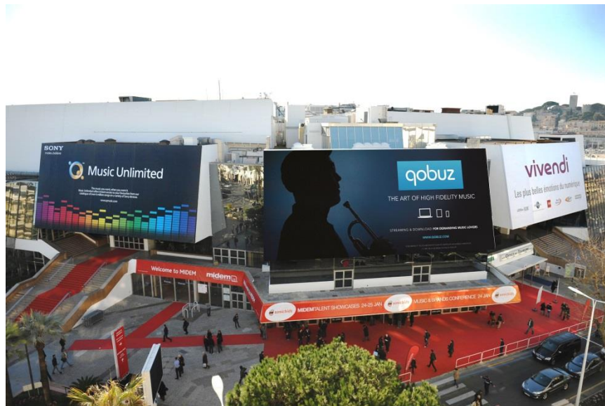
Qobuz Billboard at Midem 2016 in Cannes

Qobuz takes its place once again at Midem in what is now tradition since our creation. Then, in September, Qobuz will head off to the IFA show in Berlin.